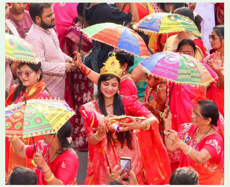
Members of the Digambar Jain community take part in a grand Golden Chariot procession on the occasion of Mahavir Jayanti from the Glass Temple in Indore, Madhya Pradesh, on Monday