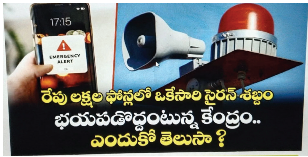
Today a loud siren sound may be heard at once on millions of mobile phones across the country. However, the central government has clarified that people do not need to be afraid or worried about this.