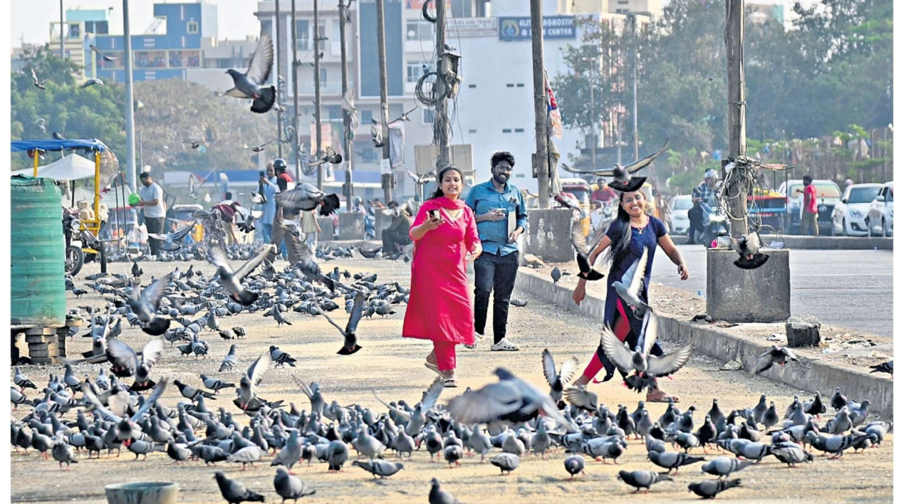
People feed pigeons at the Musalamjung Bridge in the Old City, as summer vacations for schools and colleges begin, drawing families and children to the historic spot where flocks gather in large numbers, creating a lively scene along the riverfront.