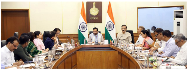
Haryana Chief Minister, Sh. Nayab Singh Saini presiding over the review meeting of Haryana Vision 2047 Action Plans, at Chandigarh on May 23, 2026.

Haryana Chief Minister Sh. Nayab Singh Saini said that the State Government is committed to ensuring adequate irrigation water reaches every field. For this purpose, the Irrigation Department should form farmer groups and construct community tanks for every 10 acres or more of agricultural land. These tanks will be filled with canal water, and irrigation will be carried out through micro-irrigation systems. The Government will provide 85 per cent subsidy for the construction of such tanks, said Sh. Nayab Singh Saini. The Chief Minister said this while chairing a review meeting of the Irrigation and Water Resources Department's five-year action plan under Haryana Vision-2047 held at the Civil Secretariat on Saturday. He said that the department must move beyond traditional irrigation systems and, in line with the concept of "Per Drop - More Crop" of Prime Minister Sh. Narendra Modi, the department must prepare future-ready plans aligned with developed countries that efficiently manage limited water resources, in order to achieve the goals of Viksit Bharat-2047. He said that despite limited water resources, their optimum utilisation is possible, and departmental schemes must be visible on the ground. He directed that farmers