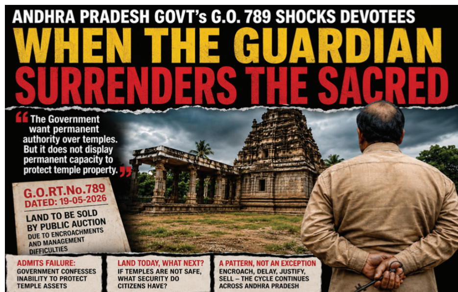
BY C. SUBRAHMANYAM

The Andhra Pradesh Government's G.O.RT.No. 789 has accidentally achieved something remarkable. It has transformed administrative helplessness into official policy language. The State now openly says temple lands are difficult to protect from encroachments, and therefore the practical solution is to sell them away. One must admire the honesty if not the logic. For decades, governments promised to act as guardians of Hindu religious institutions. Today, the same guardians appear before the public like a defeated landlord hold-