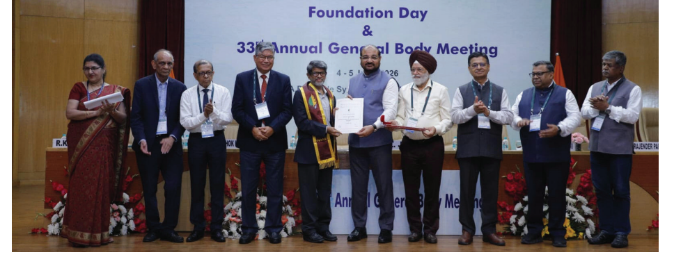
HYDERABAD, JUNE 7: